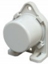
OUTSIDE TEMPERATURE SENSOR