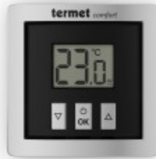
TERMET ST-292 V2