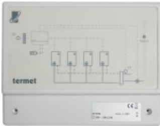
CASCADE MANAGER AX 1203 SQ