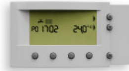
TERMET ST-292 V2